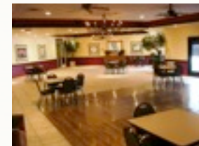
THE MAIN LOUNGE