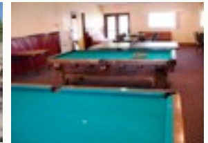
NAVAJO ROOM Pool & Ping Pong Tables