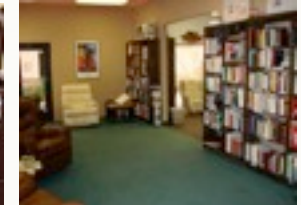
LIBRARY Computers/Wireless Network