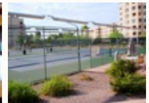
2 TENNIS COURTS