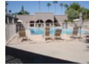
POOL 1 of 3 Jacuzzi/Exercise Rooms